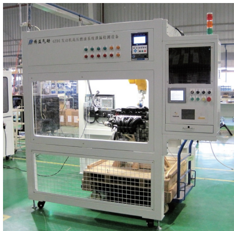
GTDI发动机高压燃油系统检漏系统 GTDI Engine High Pressure Fuel System Leak Testing Device

Product Name: GTDI Engine High Pressure Fuel System Leak Testing Device