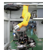
机械手自动完成氦质谱扫描 Manipulator automatically finishes helium scanning process