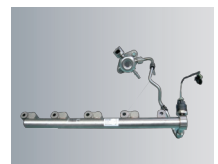
GTDI发动机燃油分配器 GTDI Engine Fuel Distributor