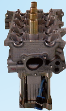
缸盖火花塞接口件 Cylinder head spark plug conduit