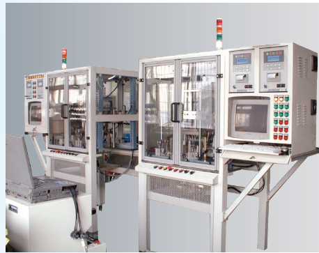
缸盖火花塞导管气密测试装置 Cylinder Head Spark Plug Conduit Leak Testing Device